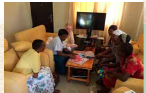
Planning the start of Care ABCD Tanzania