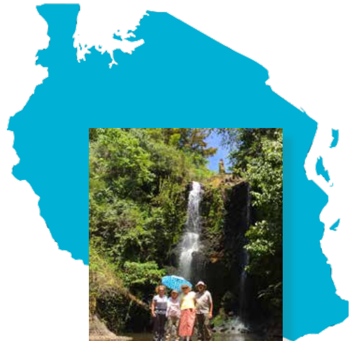
Volunteer Team at Local Waterfall

Here's your invitation to come along on our next trip to Tanzania in February of 2018 for a truly unforgettable adventure. Contact us at info@abcdreams.ca for information.