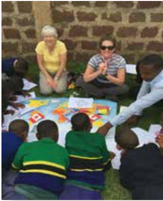
Teaching about Canada